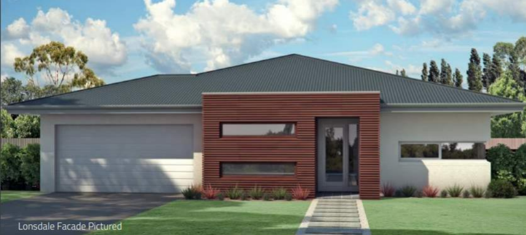
Lonsdale Facade Pictured